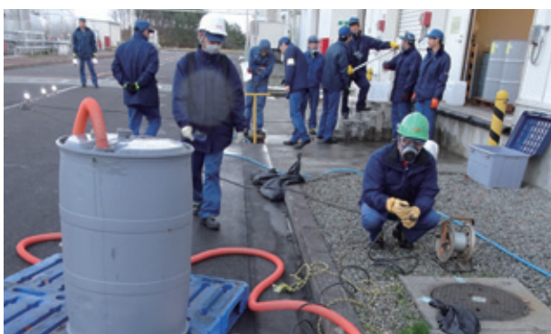
Training in Koriyama Plant

TOK operates environmental management system at each site, and periodically conducts drills for responding to emergencies and natural disasters, such as earthquakes, based on potential scenarios it has clarified for emergency situations. At each of the Company's sites, many workers from third-party vendors are often engaged in construction or maintenance of machinery. In 2018, TOK began to draw up its Third-party Vendor Management Guidelines as a common set of rules for the entire Company to prevent environmental accidents and workplace injuries when people from third-party vendors perform work. In 2019, TOK will officially release these guidelines, and create detailed rules for each site to prevent accidents and injuries.